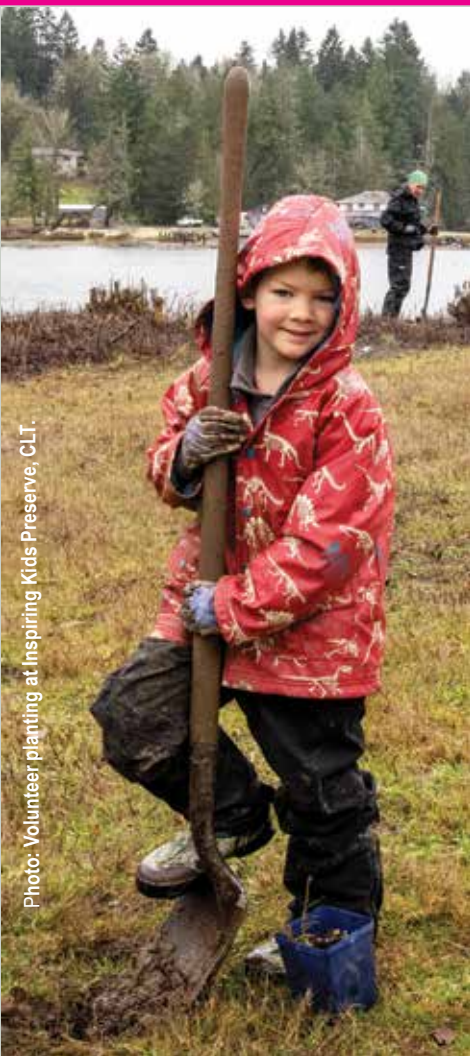
Photo: Volunteer planting at Inspiring Kids Preserve, CLT.

8 new board members began their three-year term