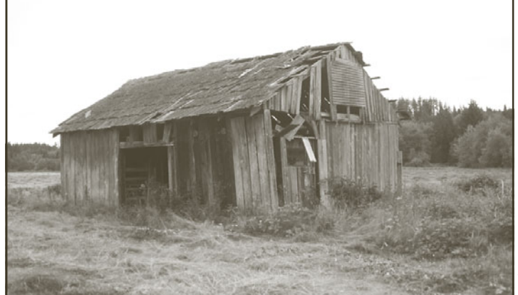
Bull Barn Before Demolition

Keep an eye out for notices of work parties out at Twin Rivers Ranch for your opportunity to visit the site and help restore this unique and breathtaking wildlife preserve in Oakland Bay!☘