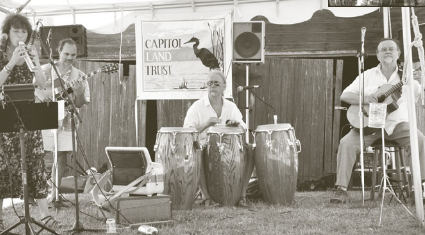
Ocho Pies entertaining guests.

Thank you sponsors! Your generosity makes the Gala possible: