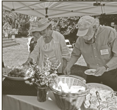
Enjoying all the fresh local foods on the appetizer table.