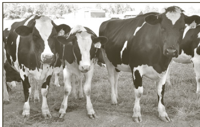
Even the neighboring cows wanted to join the party.