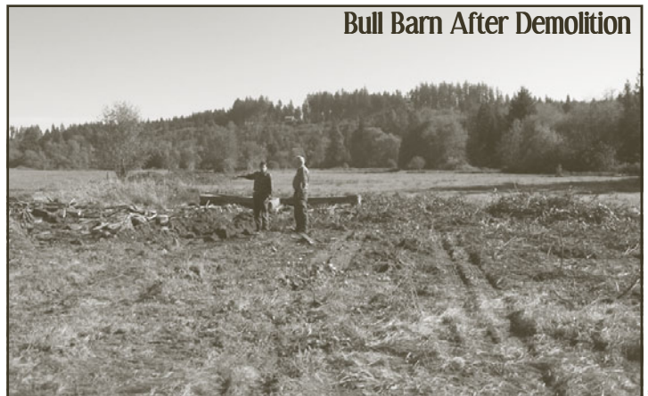
Bull Barn After Demolition