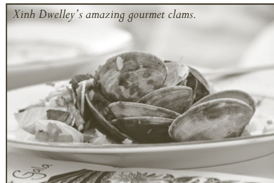
Xinh Dwelley's amazing gourmet clams.